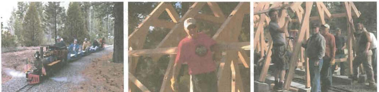
The crew ... hard at work?

https://www.facebook.com/TruckeeDonnerRailroadSociety/